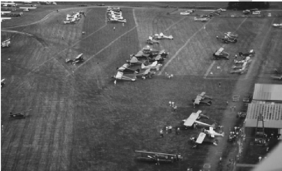
The flight line begins to fill up.