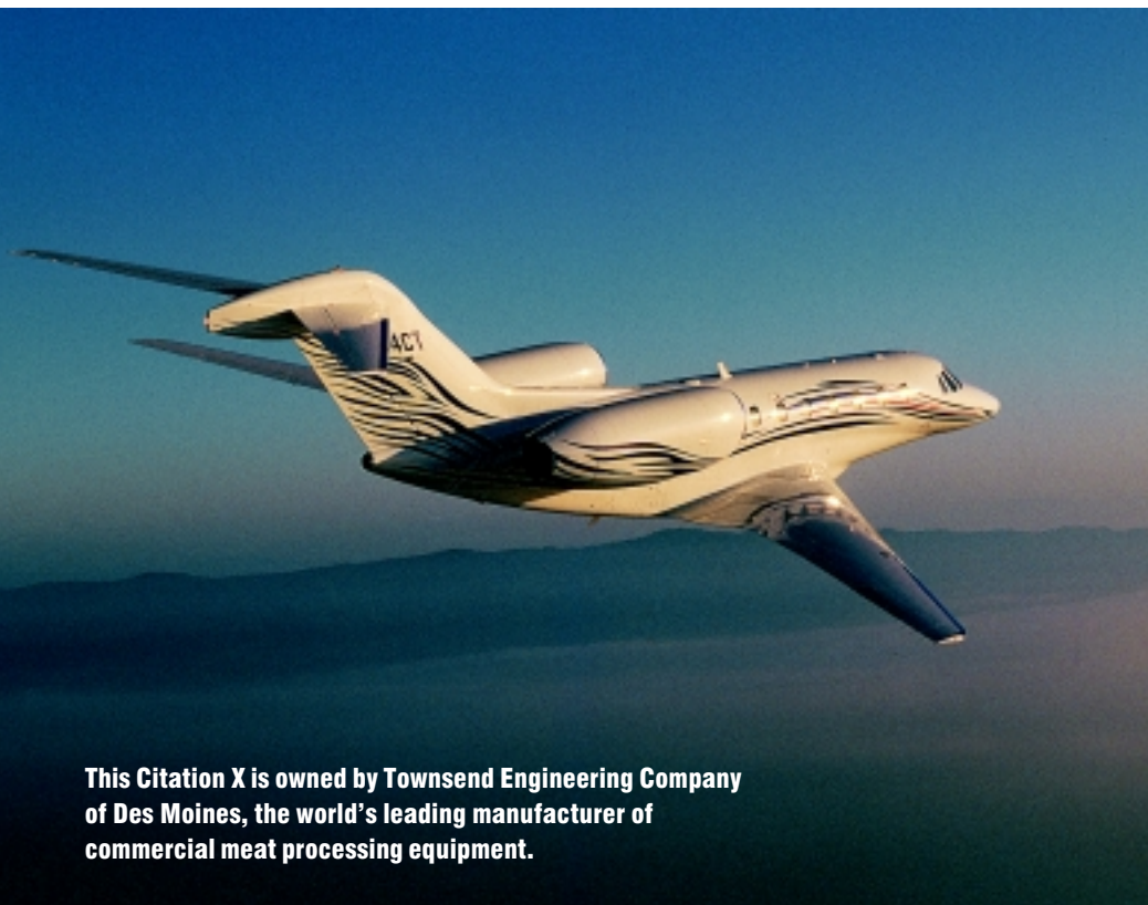
This Citation X is owned by Townsend Engineering Company of Des Moines, the world's leading manufacturer of commercial meat processing equipment.