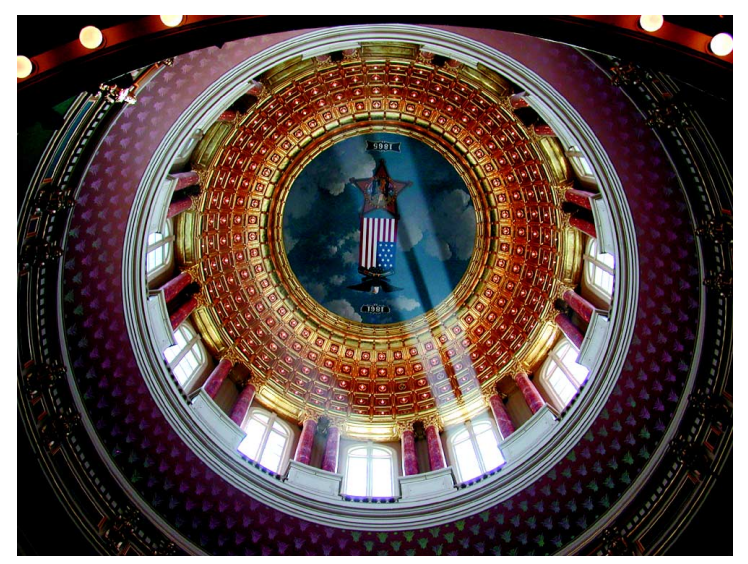
Iowa Capitol dome