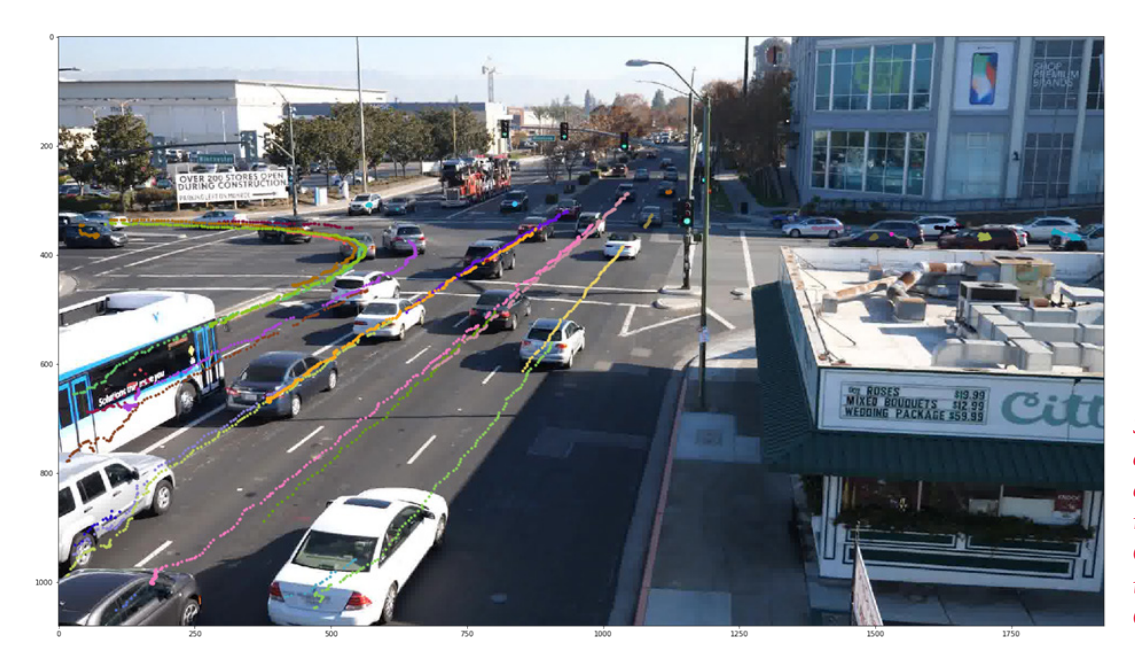
Sample vehicle detection results obtained from videos recorded at Stevens Creek and Winchester intersection in Santa Clara, California

They used a video dataset from four locations in Silicon Valley provided as part of the AI City Challenge 2018 to test the performance of the camera calibration and speed estimation methodology they had adopted.