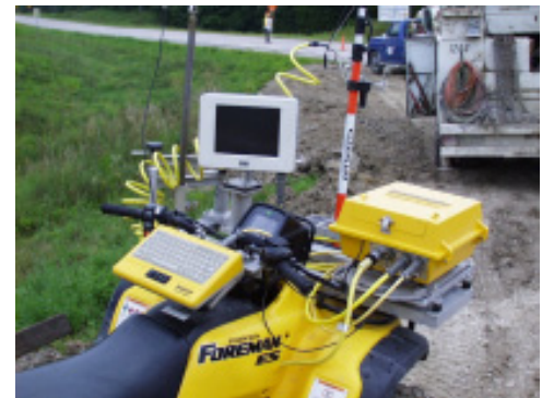
GPS installed on an all-terrain vehicle for staking or other survey work