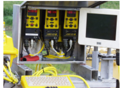
Laser height gages