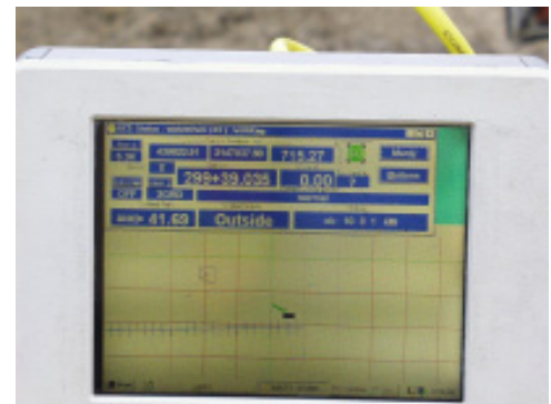
Sample screen from stringless paving control computer