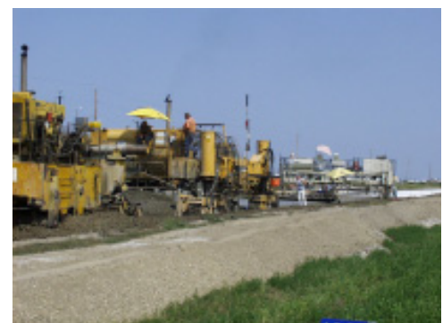
Stringless paving train