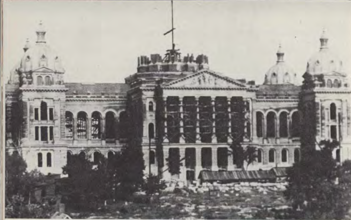
Capitol under construction, 1880.

in 1913, portions of the original grant were sold by the State.