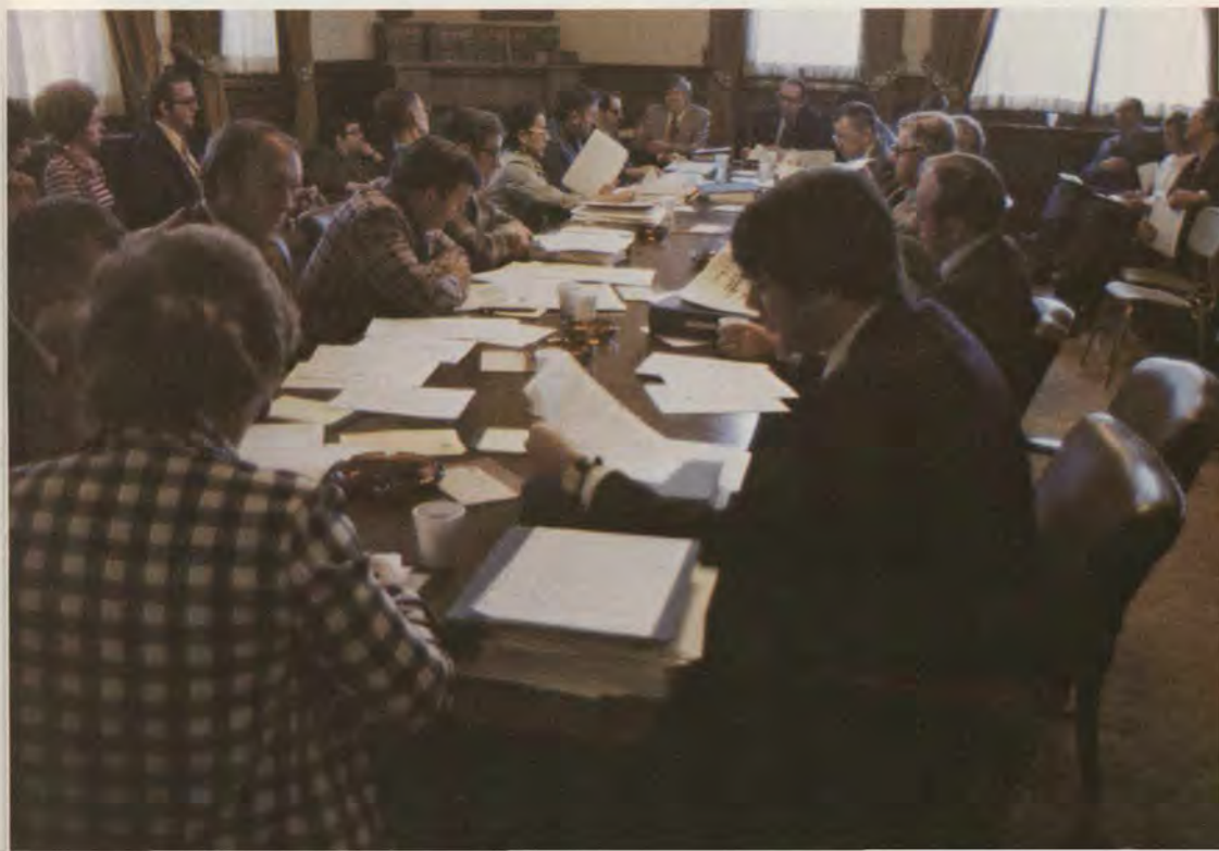
The Legislative Council in session

The Senate and House Legal Counsels are the legal officers for each body. A Senator or Representative may wish to consult with them over problems of the meaning of existing statutes or proposed bills. The counsel may be asked to furnish them with a brief on the law regarding the issue.