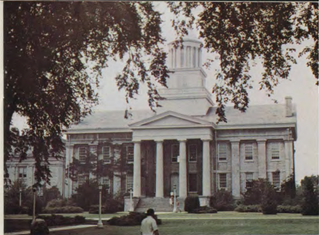
Old Capitol, Iowa City.

The admission of Iowa to the Union involved disputes over the State's northern boundary and the possibility of an over-burdened economy due to the loss of federal funds allotted to a territorial