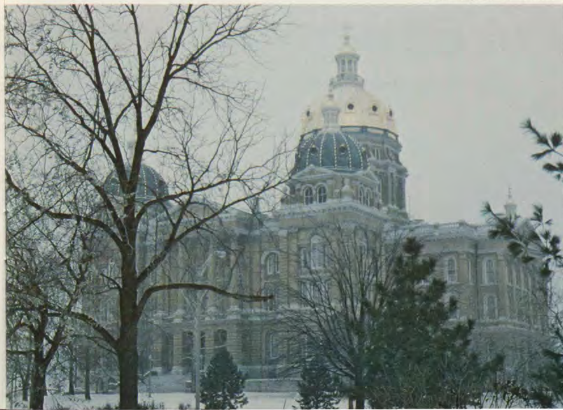
The Capitol in Winter

"Food will win the war" also became a popular slogan of the time, and farmers were granted loans and price supports as incentives for the purchase of more land and more production. Unfortunately, this productivity resulted in massive surpluses of grain. Then when the subsidies were removed in 1920, the bottom dropped out of the farm