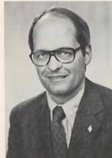
Lieutenant Governor Arthur A. Neu

Between the session and interim business, legislators are continually busy. Despite that, they always desire to meet with their constituents. When you visit the Capitol, be sure to contact your Senator or Representative.