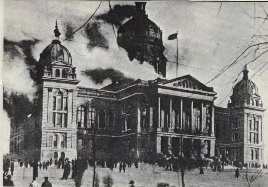
Fire in the House Chamber, 1904.

It is for us all a source of profound gratification that from the day when the present commissioners assumed control with their accomplished Superintendent of Construction, the legislative bodies have never withdrawn from them their confidence. Not one act of speculation or spoliation, not one coin wasted or vainly spent has defaced the bright record of their administration. It shall be a part of the legacy we leave our children that all these vast and durable walls have been laid in the cement of honesty, and built by the rule of fidelity. More proud of this legend are we than of all these classic columns and brilliant domes which please the eye and gratify the taste.