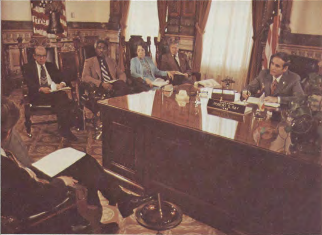
Governor Robert D. Ray meeting with visitors to his office