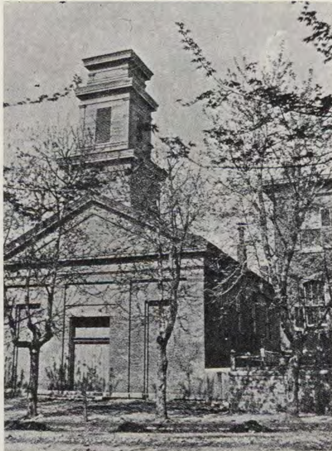
Old Zion Church, Burlington.

near the geographical center . . . and be consistent with the interest of the state, generally."