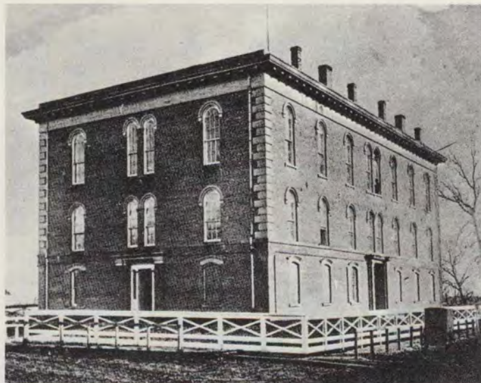
Old Brick Capitol, Des Moines.

Although free from slavery as a result of the Missouri Compromise of 1820, Iowans boldly denounced human bondage and aided in the skirmishes which eventually led the Nation to civil war. Tabor in the southwest corner of Iowa served as training ground for anti-slavery proponents going into the battles of "Bleeding Kansas"; it also served as a refuge for their return. One of the first underground railroads in the State sent escaped slaves to their freedom northward via Tabor to the cities of Earlham, Des Moines, Grinnell and Iowa City. Clinton and Muscatine served as popular crossing points on the Mississippi.