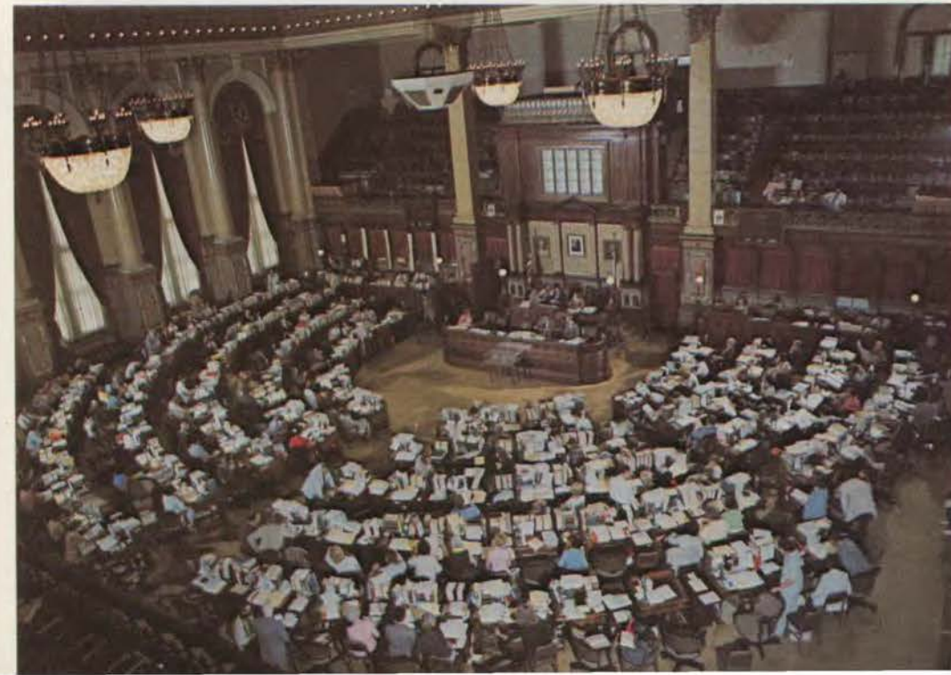
The House in Session.