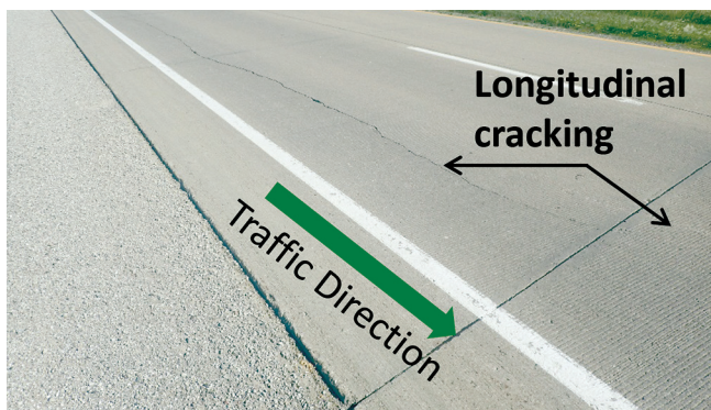
Longitudinal cracking observed on IA-163 with widened slabs in Mahaska County, Iowa

Concrete core samples were taken by Iowa Department of Transportation (DOT) crews at six of the longitudinal cracking locations.