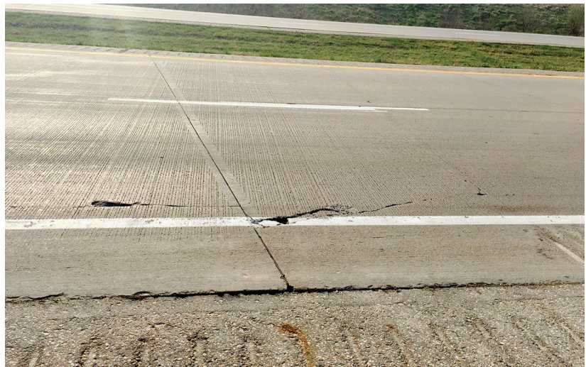
Longitudinal cracking observed in widened concrete pavement with a skewed transverse joint on US-65 in Polk County, Iowa

This distress pattern has never been reported before in Iowa, and an investigative study was needed to better understand the causes of this distress pattern. Although there is strong evidence for the occurrence of random longitudinal cracking in JPCPs in many states, few studies have documented the causative factors and prevention or mitigation strategies.