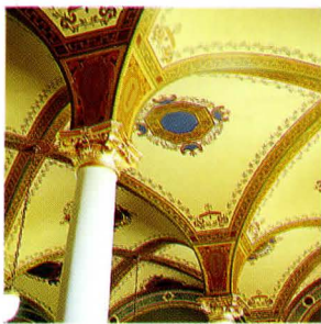
SHSJ, Chuck Greiner

Every aspect of the Capitol's architecture is breathtaking for visitors, from mosaic artwork and detailed stenciling, to the marble Grand Stairway, three-story open rotunda and the statues and monuments surrounding the building.