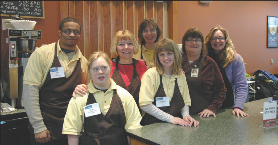
Students, teachers and volunteers at Plymouth Grounds pose for a photo after another successful day.

The February edition of Each and Every Child touched a lot of readers throughout the state. The issue focused on the practices of high-growth schools. Below is a sampling of your thoughts.