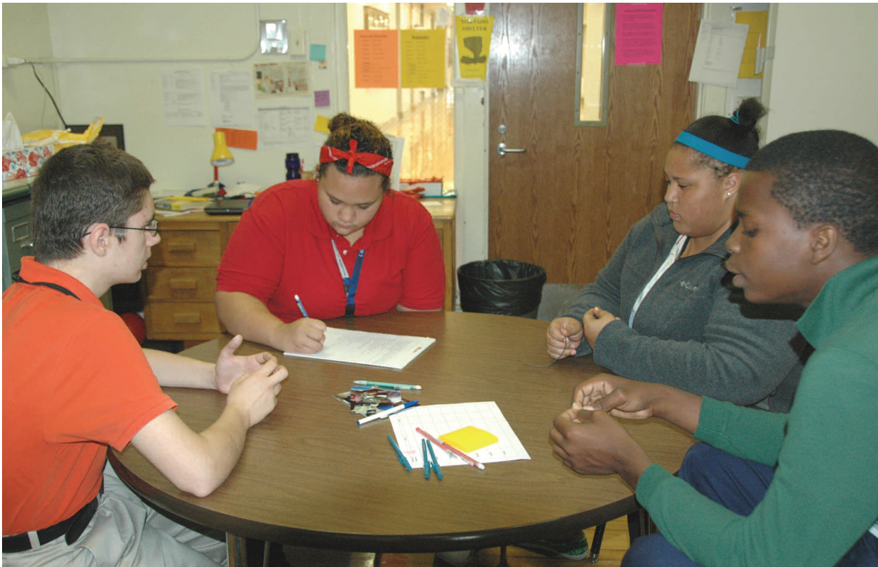
Some members of Link, an afterschool program designed to engage them in school and real life, plan out the coming school year.