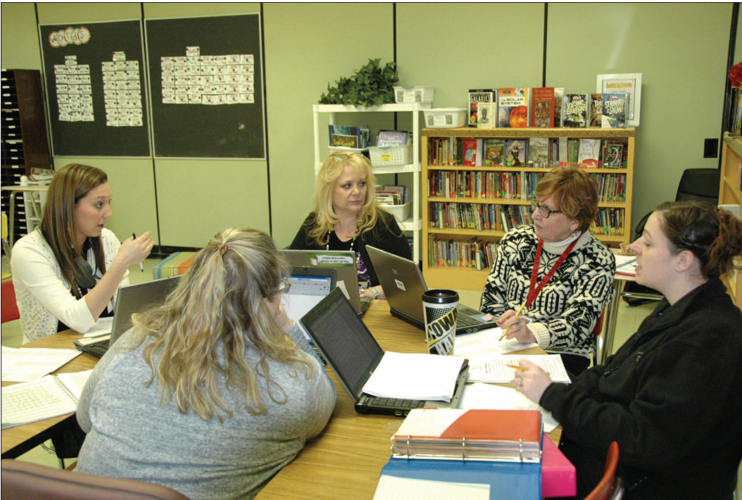
Educators at Hoyt Middle School meet regularly to discuss individual results.