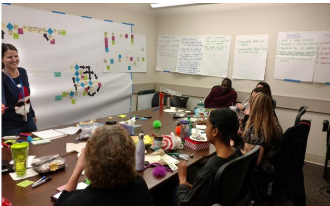
Ryan White (RW) Part B Program and the HIV Surveillance Program staff participate in a Quality Improvement (QI) Adventure.

To receive weekly updates on the session, subscribe to the IDPH Legislative Update.