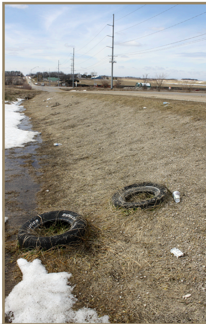
As spring nears, the snow melts to reveal gravel deposited along an Iowa roadside.