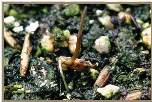
Canada wild rye, Elymus canadensis seed germinating

Creating a lush stand of prairie grasses is an easy thing to do. Sow 40 seeds/ft 2 of big bluestem, little bluestem, side-oats grama, Indian grass and switchgrass in the spring, cultipack after seeding, mow 3-4 times in the first growing season and 2-3 years later a lush stand of prairie grasses will result. However, creating a diverse stand of prairie grasses and forbs is a much more difficult task. Including forbs in a native grass seed mix doesn't necessarily guarantee that the forbs will be present in the stand. The lack of forb establishment can be due to seed dormancy, seed granivory, seed lost by wind, water, and soil erosion, improper planting depth, and/or inadequate seeding rate. Recent research has found yet another reason for the lack of forb establishment - sowing too many seeds of some native grasses. Specifically, big bluestem, Indian grass, and switchgrass seeded at rates of 9.0 seeds/ft 2 (2.5 lbs./ac), 6.0 seeds/ft 2 (1.4 lbs./ac), and 1.0 seeds/ft 2 (0.2 lbs./ac), respectively, will significantly reduce forb establishment, growth, and species richness (Dickson et al. 2009, Prairie Moon 2009). Forb establishment, growth, and species richness improved significantly when these grass species were seeded at half these rates, and was maximized when the forbs were seeded