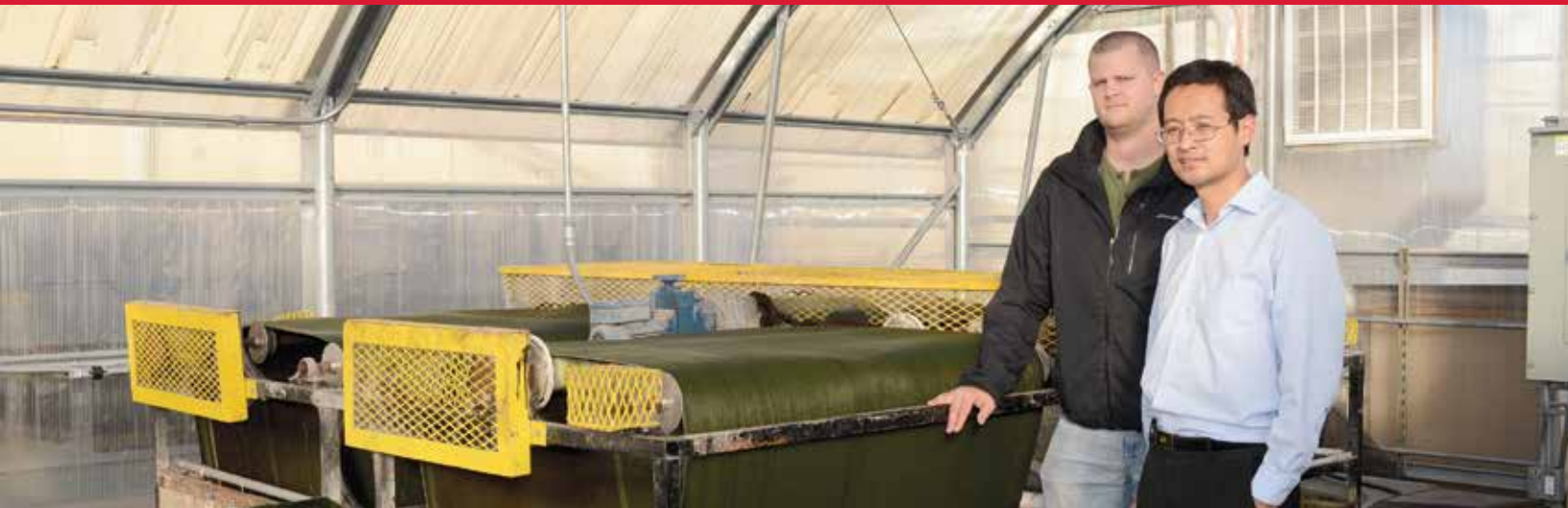
The algae treatment system currently exists in a smaller, mobile form (bottom) and in a greenhouse on the Iowa State campus.