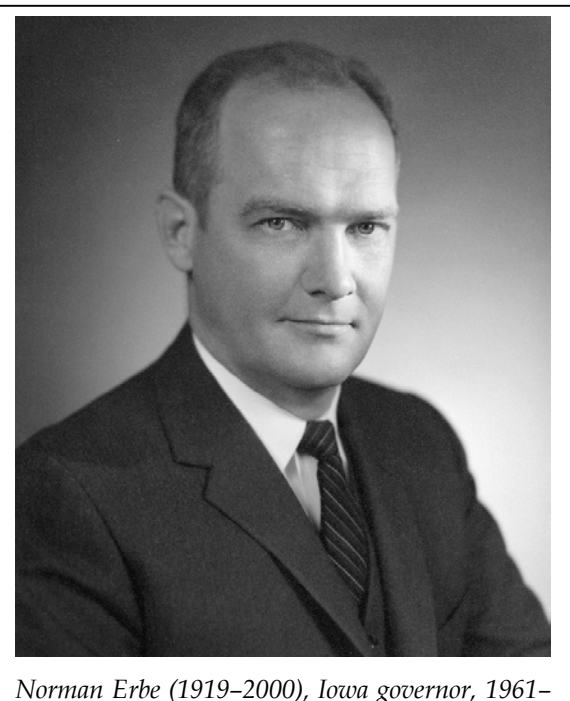
Norman Erbe (1919–2000), Iowa governor, 1961– 1963.

Erbe's strategy during his re-election bid in 1962 was to avoid making waves. The Iowa legislature, not the governor, he argued, makes the laws. "I don't want to come out whole hog for this position or that if it doesn't materialize in the Legislature, "he said. "There's no use doing this unless you know you have the votes. . . . My concept of the governorship is that of an administrator and executive through persuasion. In our weak governor system, it's impossible for the governor to impress his will if the Legislature or government departments don't want to follow." Erbe said that the liquor-by-the-drink issue was up to the Iowa General Assembly; he wasn't going to push the issue. He claimed to be guided by the state Republican platform, which only said that the issue should be "studied." He refused to go further than that.<sup>24</sup>