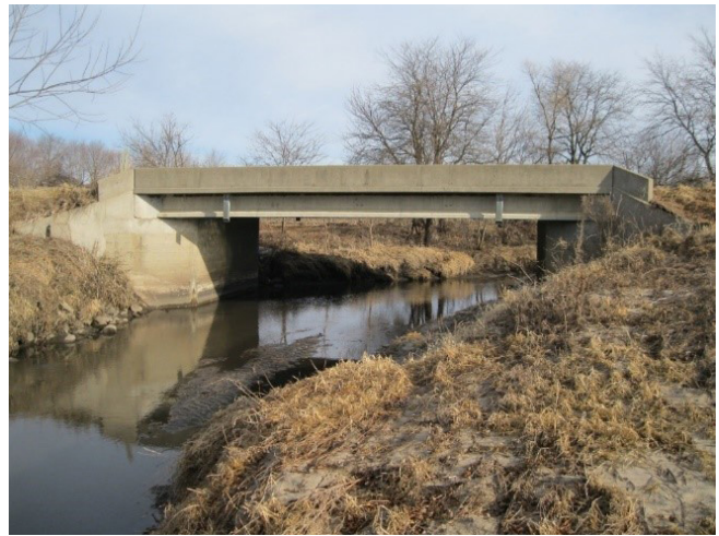
Elevation view of one of the five steel-concrete bridges used for field testing

The results of the field testing and analytical models were used to provide recommendations on upper limits for dynamic load allowances (IMs), as well as several equations for determining live load distribution factors (LLDFs) specifically for implements of husbandry.