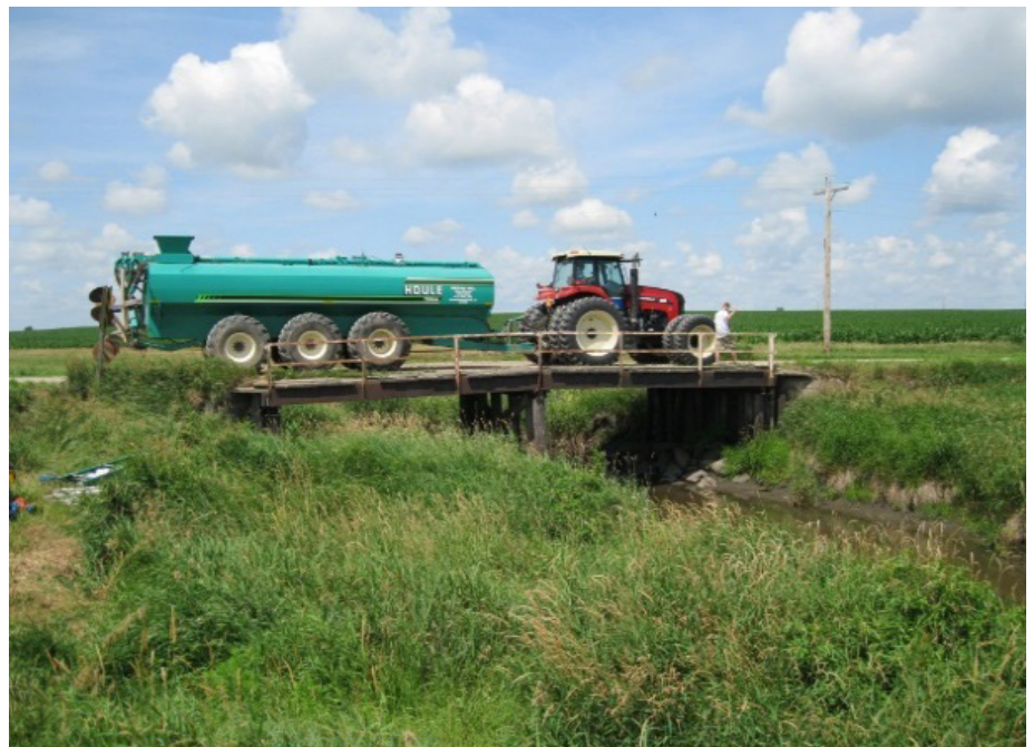
Vehicles used in field testing included a tractor towing a three-axle liquid manure applicator, also known as a honey wagon tank

The objectives of this study were to develop guidance for engineers on how implements of husbandry loads are resisted by traditional bridges, with a specific focus on bridges commonly found on the secondary road system; provide recommendations for accurately analyzing bridges for these loading effects; and make suggestions for the rating and posting of these bridges.