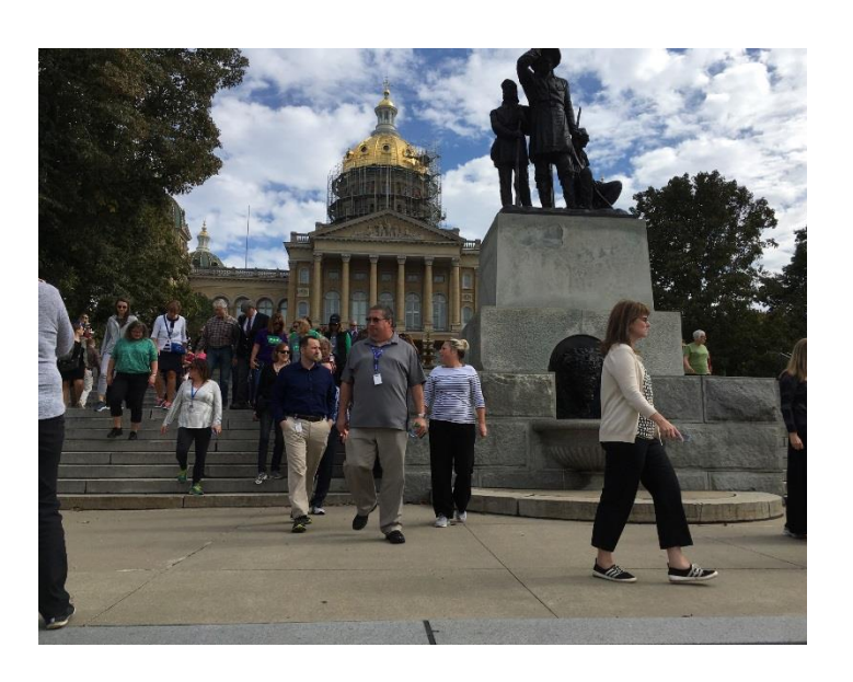
Thousands of Iowans, including dozens of IDPH staff participated in the annual <u>Healthiest State Walk</u> October 4.

IDPH is proud to support Governor Reynolds in a week dedicated to opioid awareness, October 23 through 27. The week's itinerary includes a special roundtable discussion, "Identify, Prevent, Recovery: Combatting Opioids in Iowa," October 26. The Governor's office will announce details.