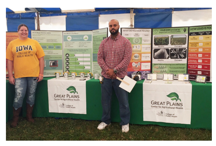
The GPCAH was at the Farm Progress Show, providing information on hearing loss prevention, whole body vibration and heat illness prevention.

Look for the GPCAH staff at the Big Iron Farm Show in West Fargo, ND (September 12-14) and at the National Association of Extension 4-H Agents in Indianapolis, IN (November 12-16). Many of the posters, handouts, and activities used at the outreach events are also available on the GPCAH website at www.GPCAH.org