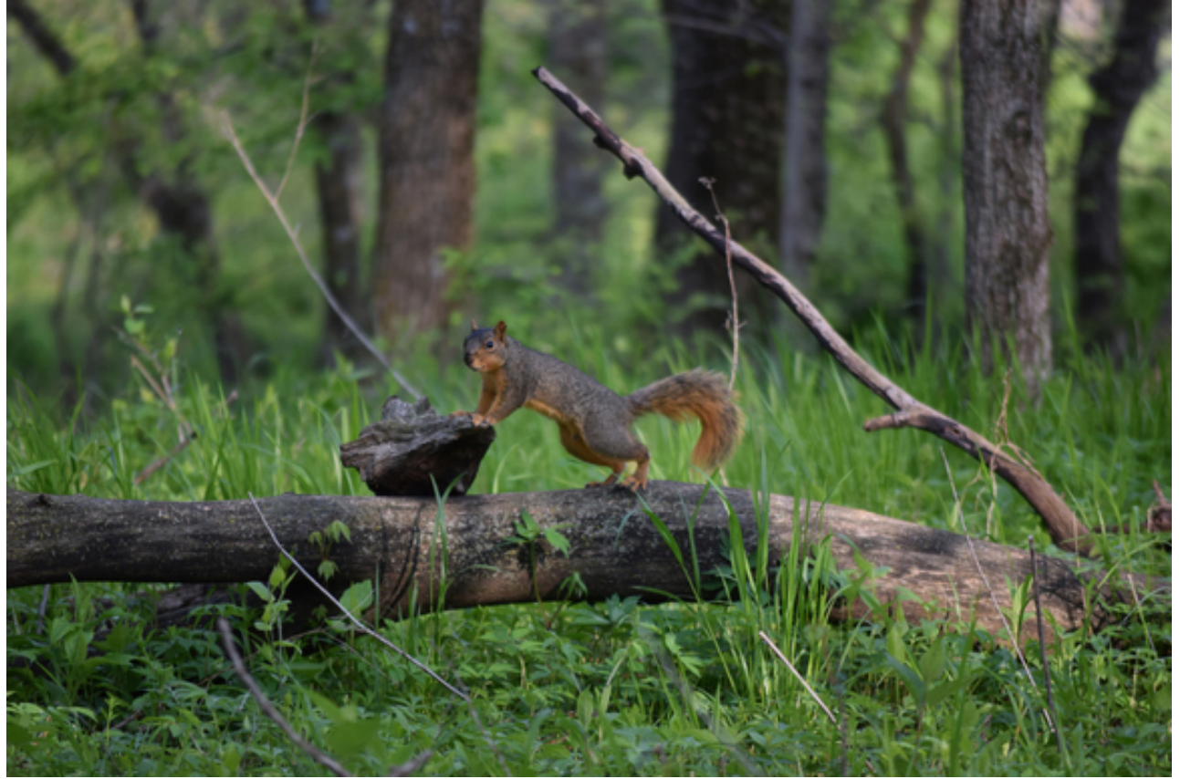
Hunting opportunities for squirrels is excellent with higher squirrel numbers in areas with quality oak and hickory trees. Squirrel season is Sept. 2 through Jan. 31, 2018.

Squirrel hunters should expect to find an average to above average squirrel population over most of the state, with higher squirrel numbers in areas with quality oak and hickory trees. Squirrel season opens Sept. 2.