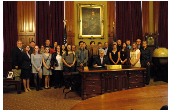
Safe Schools Alliance video contest winners and Iowa School Safety Alliance members attended School Safety Week proclamation signing.

America's Safe Schools week was Oct.16-22. Governor Terry E. Branstad signed a proclamation celebrating Iowa's support of the national week of observance. The proclamation was supported by the Iowa School Safety Alliance to memorialize the importance of safe schools in Iowa. Iowa School Safety Alliance focuses on low cost initiatives that schools can implement to make their environments safe. Selected as the top three finalists for the Iowa Safe Schools Alliance video contest, students from Council Bluffs, North Fayette, and Alburnett school districts were present for the event.