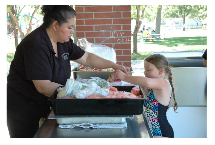
A young participant in the West Des Moines Community School District summer food program is served lunch at Legion Park in West Des Moines.

"If you build it, they will come," a quote many may recognize from the movie Field of Dreams . Set in rural lowa, the film explores a farmer's decision to plow down his cornfield and build a baseball diamond in its place. While the film is fictional, the 'if you build it' philosophy is alive and well in lowa this summer, in an urban park. Exactly what has been built may come as a surprise. With West Des Moines Community School District as the architect, Legion Park hosts a very well-built, successful summer food program for families seeking an appetizing, nutritious meal. Read more.