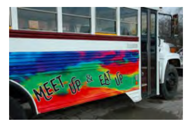
Staff and volunteers converted an old school bus to accommodate summer lunch service for children at seven locations throughout the Davis County Community School District.