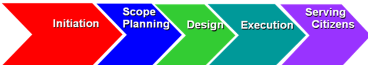
Figure 1. IOWAccess Project Lifecycle

Phase 1 - Initiation - This requires the investment of a small amount of resources, resulting in a reliable estimate of the cost of gathering and documenting detailed requirements. The deliverables