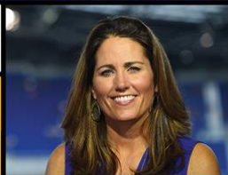
Honorary Chair Julie Foudy

LIBRARIES TRANSFORM LIBRARIESTRANSFORM.ORG