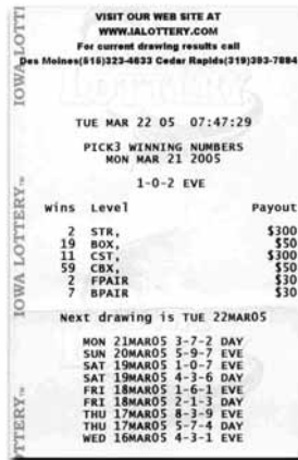
A Pick 3 winning numbers report from the Extrema