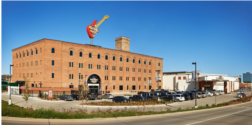
Sioux City, IA