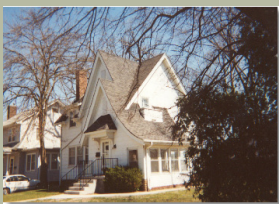
The Larned A. Waterman Iowa Nonprofit Resource Center 130 Grand Avenue Court Iowa City, IA 52242 1.866.500.8980 http://inrc.continuetolearn.uiowa.edu/default.asp

All newsletter content is provided for informational purposes only and does not constitute legal counsel. Although we have made every attempt to ensure accuracy, the INRC is not responsible for any errors or omissions or for the results obtained from the use of this information. All information is provided with no warranty of any kind.