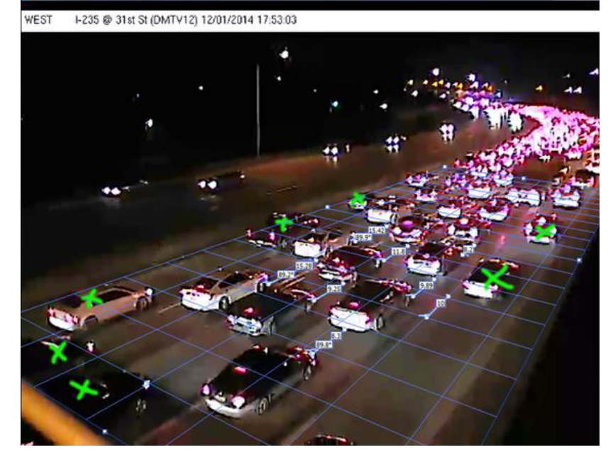
Camera image processed to obtain standstill distance measurements

Two crucial inputs to calibrate VISSIM are standstill distance and headway. Standstill distance, the distance between stopped vehicles, indicates the maximum traffic density on a roadway section, in that vehicles are as close together as possible. Headway, the elapsed time between the front bumper of the leading vehicle and the front bumper of the following vehicle, indicates the capacity of a roadway section; when all vehicles are at their headway, any additional traffic density causes vehicles to begin braking, which in turn causes congestion. Time gap is similar but is defined as the elapsed time between the back bumper of the leading vehicle and the front bumper of the following vehicle.