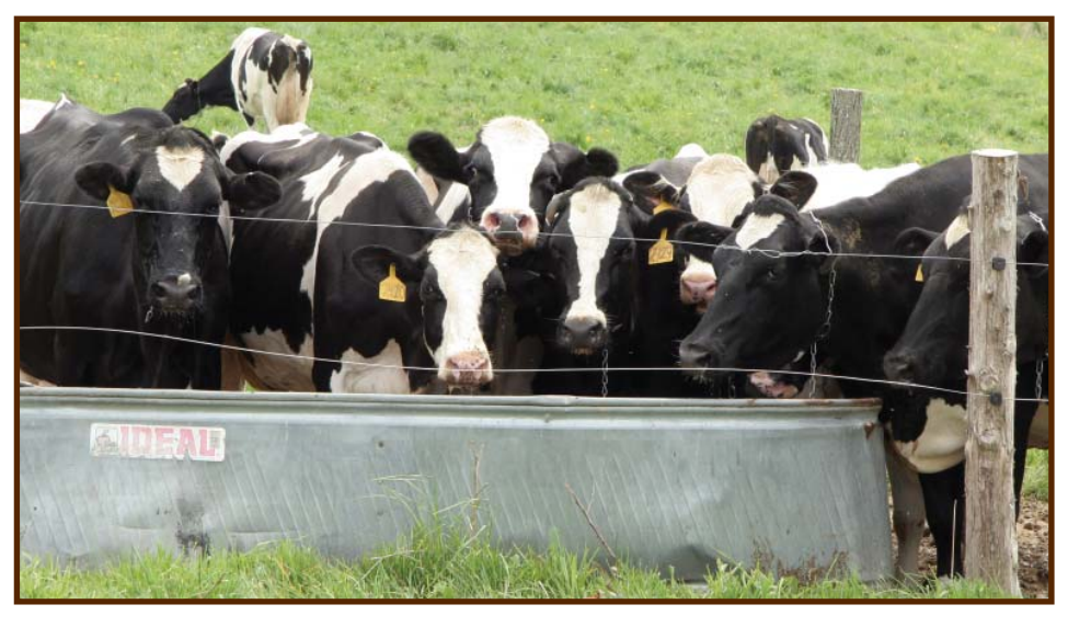
Water troughs provide a moist, nutrient-rich environment for bacterial survival, including the bacteria known to cause Johne's disease.

To inhibit the spread of MAP and exposure of susceptible animals to MAP on infected farms, best management practices aimed at maintaining biofilm-free trough surfaces should be included in any Johne's disease control plan.