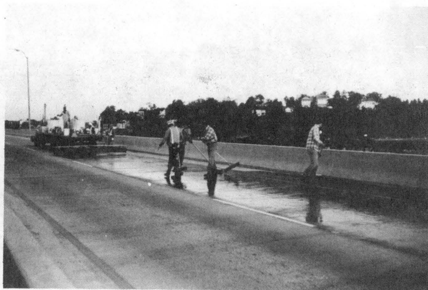
Figure 2 Application of HMWM Resin