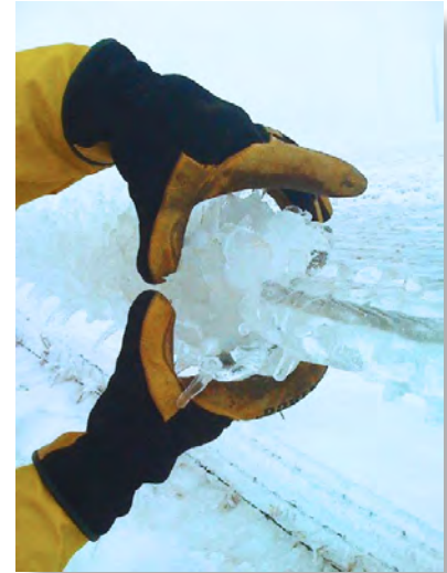
Ice covering a power line.