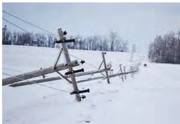
Utility poles damaged by ice storm

An April 2013 ice storm caused millions of dollars in damage to electrical utility