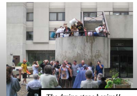
The drying stage begins!! Over $1,000 was raised for ALS! Way to go IVH!!