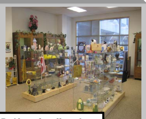
Residents & staff stay busy with Ceramics and Arts & Crafts.