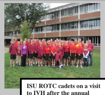
ISU ROTC cadets on a visit to IVH after the annual game ball exchange between ISU and University of Iowa ROTC.