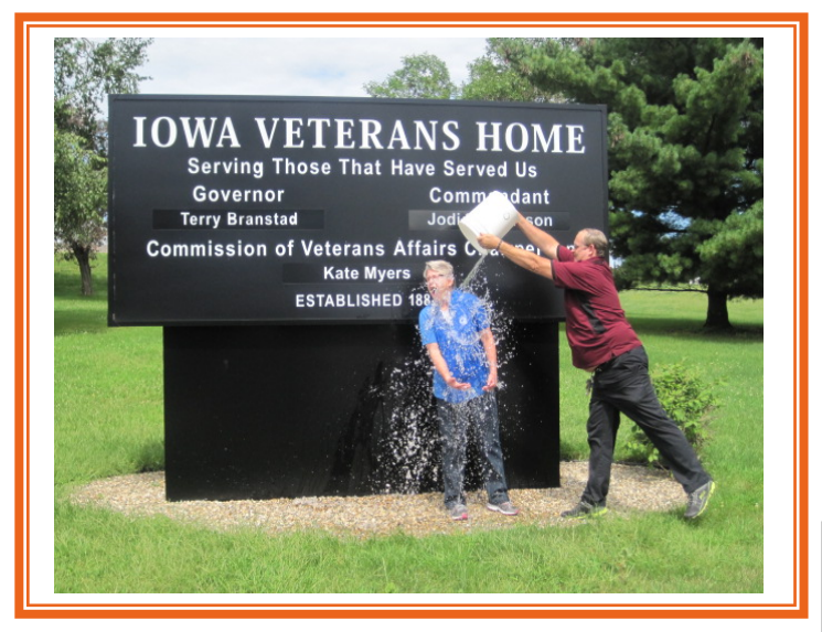
IVH Commandant takes the ALS Ice Bucket Challenge