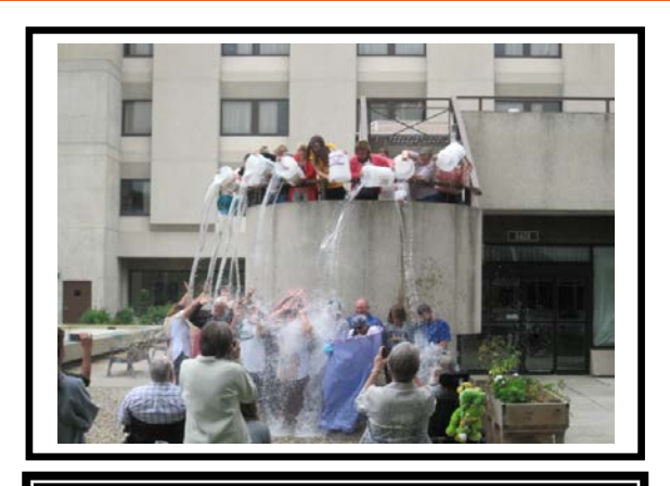
....and our dedicated staff here at IVH!!!!