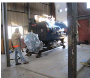
Boiler is Moved Into Position

gas, fuel oil and steam before testing the unit. This project is estimated to be completed by end of January.