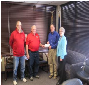
Iowa Elks Association