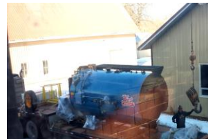
Boiler Gets Unloaded

The construction of the new Transportation Building is almost complete. The walls, doors and roof panels have been installed. The power has been run and the door operators will be installed soon. IVH should be using this sometime in January. The boiler project is almost complete as well. The boiler was delivered and set in place. The piping must be run for