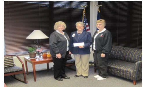
Iowa State Bowling Association