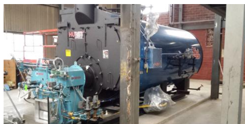
New Boiler In Place at Power House