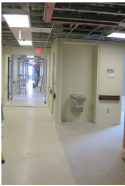
Fourth Floor Malloy North

The Malloy building is progressing to the point that it's beginning to look like something we can soon live in. The fourth floor is getting handrails and water fountains installed. The ceilings will be installed soon. The resident rooms are getting cabinets and wardrobes installed and the resident restrooms look very nice with the tile, sink, toilet, shower and cabinetry in place. The restrooms in the basement of Malloy are complete and work has begun on the main floor restrooms by Ceramics. Window installation is also continuing.