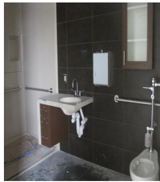
Fourth Floor Malloy North Resident Restrooms

The Malloy building is progressing to the point that it's beginning to look like something we can soon live in. The fourth floor is getting handrails and water fountains installed. The ceilings will be installed soon. The resident rooms are getting cabinets and wardrobes installed and the resident restrooms look very nice with the tile, sink, toilet, shower and cabinetry in place. The restrooms in the basement of Malloy are complete and work has begun on the main floor restrooms by Ceramics. Window installation is also continuing.