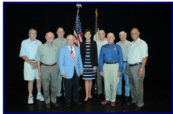
Marshall County Veterans Affairs

Group Governor's Volunteer Award, nominated by Iowa Veterans Cemetery: American Legion Post #403, Van Meter