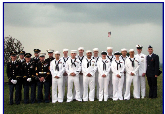
Ceremony Honor Guard

IVC also assisted with the burial of seven veterans discovered by MIAP in a ceremony held in 2009. For information on the Missing in America Project, visit their website at: www.miap.us .