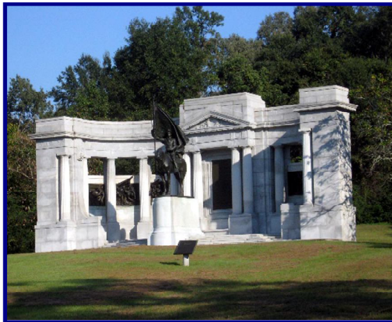
Iowa Monument — Vicksburg, Mississippi