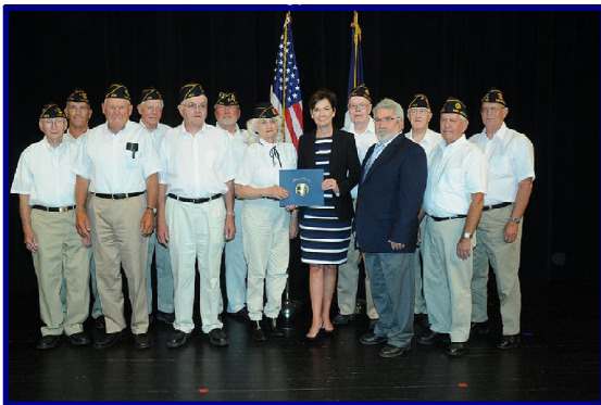
American Legion Post #403 Van Meter