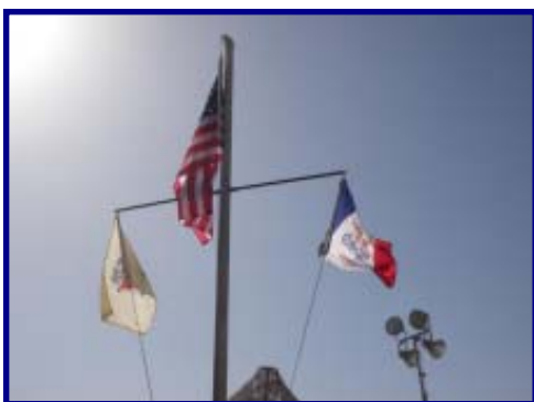
Iowa Flag flying in Afghanistan