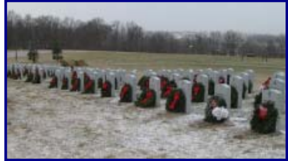
Iowa Veterans Cemetery – December 11, 2010

Thanks to generous donations from Caseys, Prairie Meadows, and individual families, Wreaths Across America™ delivered over 635 wreaths to be placed on the graves at Iowa Veterans Cemetery. Another commitment to this project included a multitude of volunteers who participated in the laying of the wreaths, including the Knights of Columbus and the Civil Air Patrol IA-007 Northwest Iowa Composites Squadron. The Civil Air Patrol also provided an Honor Guard for the ceremony.