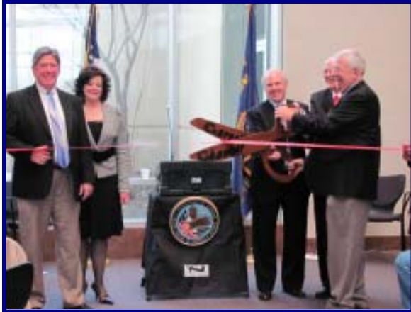
Carroll CBOC Ribbon Cutting

Carroll County has a new community-based VA clinic. Carroll's new CBOC offers many advantages...Veterans can receive medical and mental health services closer