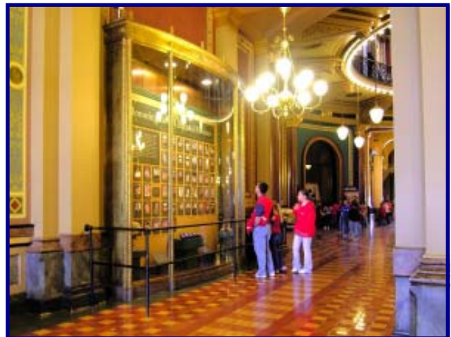
Two views of the “Honoring Iowa’s Eternal Patriots” exhibit located in Iowa’s Capitol rotunda