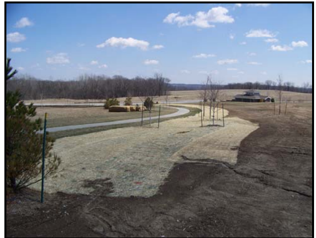
Seeding along the walkway toward the Committal Service Shelter

Another affected area has been along the sidewalk that runs from the administration building south to the Committal Service Shelter. Seeding and matting has been applied along these troubled areas.