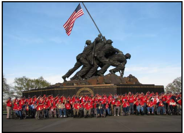
The group saluting at the Iwo Jima Monument