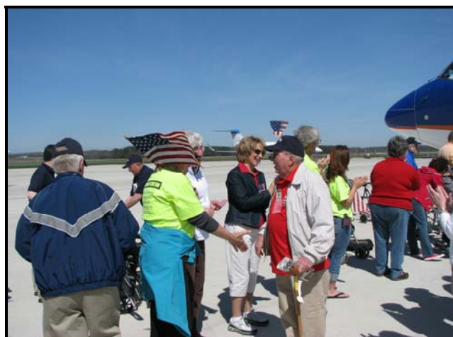
Volunteers hugged and thanked Iowa World War II veterans as they arrived in Washington, DC

The plane arrived at Dulles International Airport and as the veterans deplaned, they were greeted by twenty Honor Flight volunteers from Washington, DC.