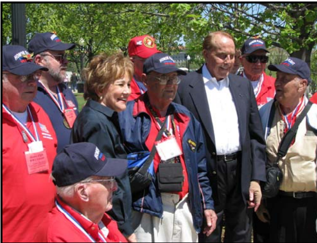
Former Senators Bob Dole (R-Kansas) and Elizabeth Dole (R-North Carolina) were at the WWII Memorial to greet veterans

Following lunch, the group visited the Lincoln Memorial end of the Mall and was able to visit the Korean and Vietnam Memorials while in the shadow of the 16 th President.