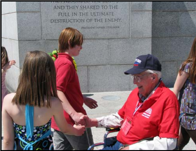
Complete strangers on several occasions approached the Iowa veterans and thanked them for their service. This was one of the most emotional parts of the trip.