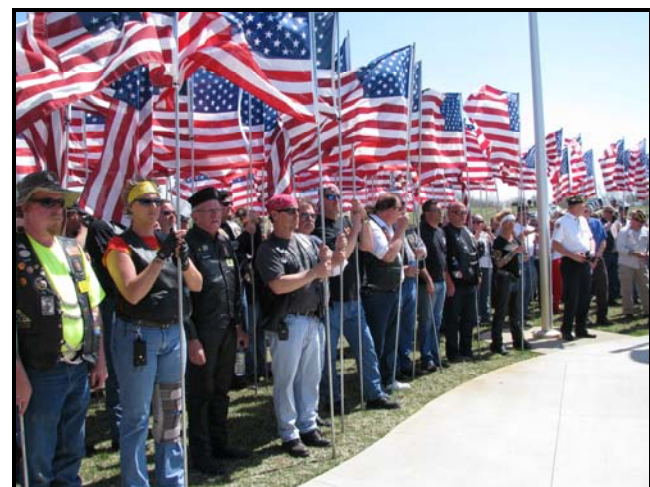
Hundreds of flags were carried by those in attendance