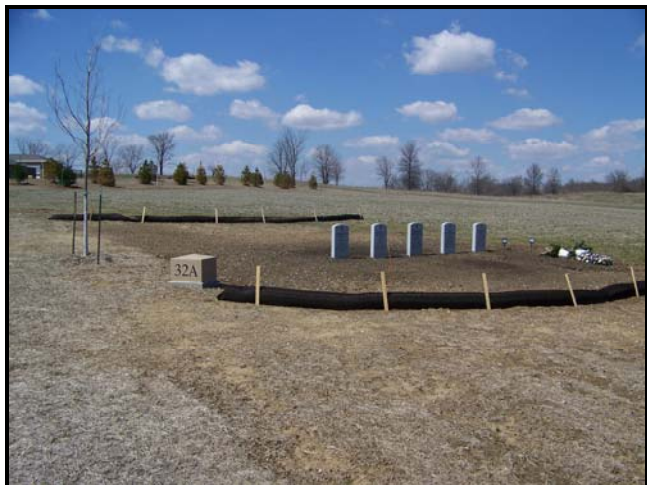
Erosion control methods surrounding newly placed headstones

The department is in the process of obtaining bids from seed vendors and plans to seed the affected areas. Both Dallas County and the Iowa Department of Transportation (Iowa Roadway Trust Fund) have stepped up to assist staff. They have donated money, time, and product to combat erosion.