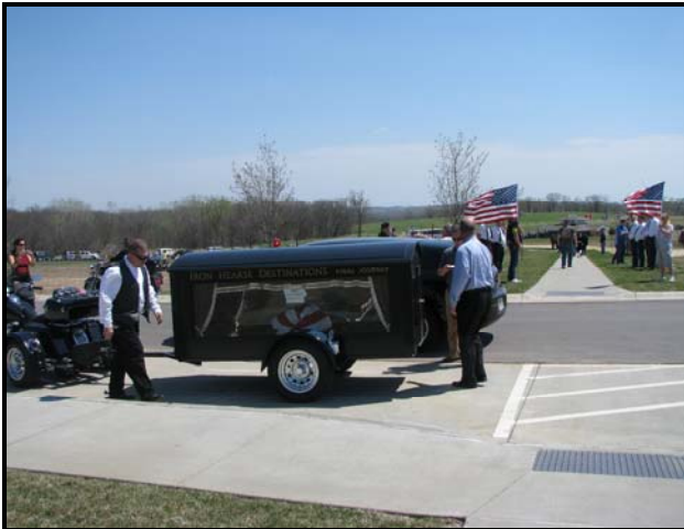
The "Iron Hearse" that transported the cremated remains from Knoxville, IA