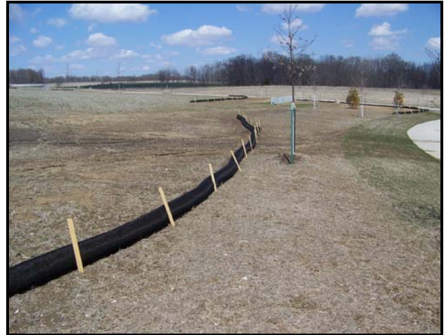
Additional attempts to control erosion near the administration building

Another affected area has been along the sidewalk that runs from the administration building south to the Committal Service Shelter. Seeding and matting has been applied along these troubled areas.