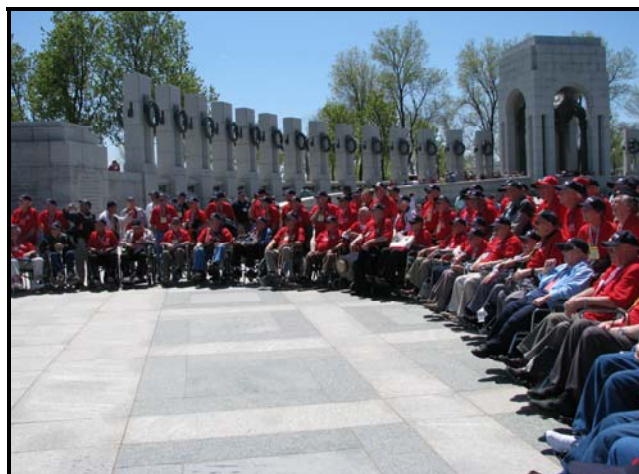
Iowa Veterans at THEIR Memorial!

Immediately upon arriving, the veterans were bused to the WWII Memorial on the Capitol Mall.