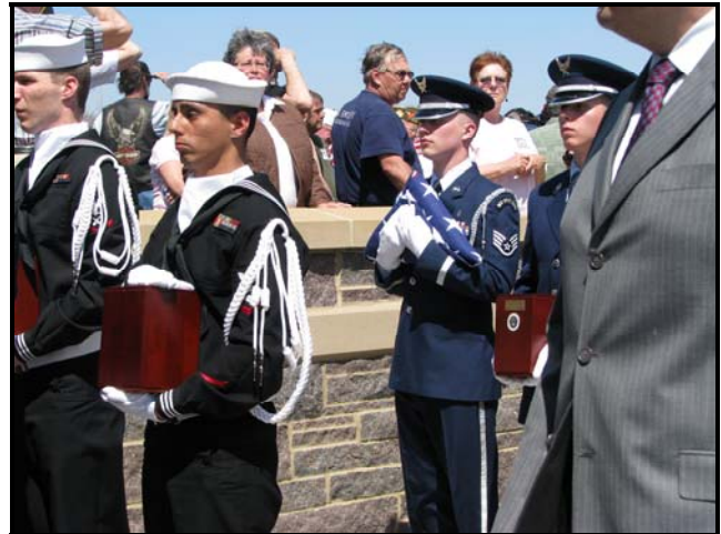
Honor guard carrying the veterans to the Committal Service Shelter