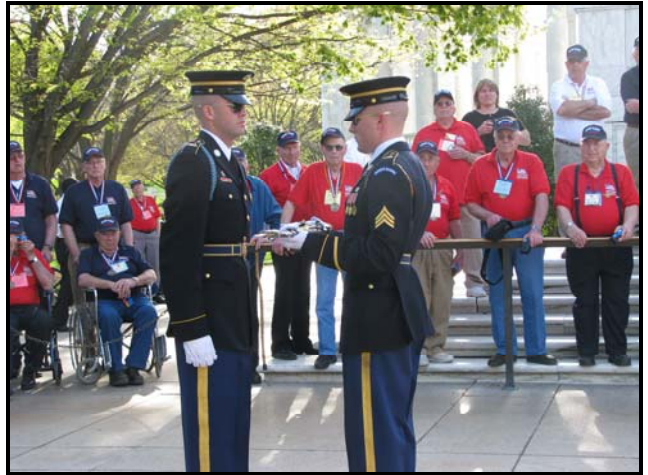
Changing of the Guard

Next there was a bus tour of the capitol city that took the three buses by the Department of Agriculture, several Smithsonian Museums, the Capitol building, and the White House. Following this, the tour continued to Arlington National Cemetery for the changing of the Guard at the Tomb of the Unknown Soldier and a visit to the Iwo Jima Memorial. The group then departed and returned to Mason City for a hero's welcome. ~