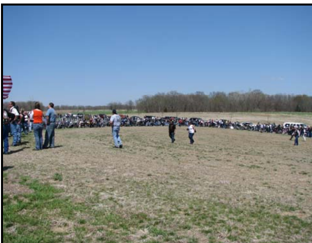
Hundreds of motorcycles at the funeral of seven Iowa