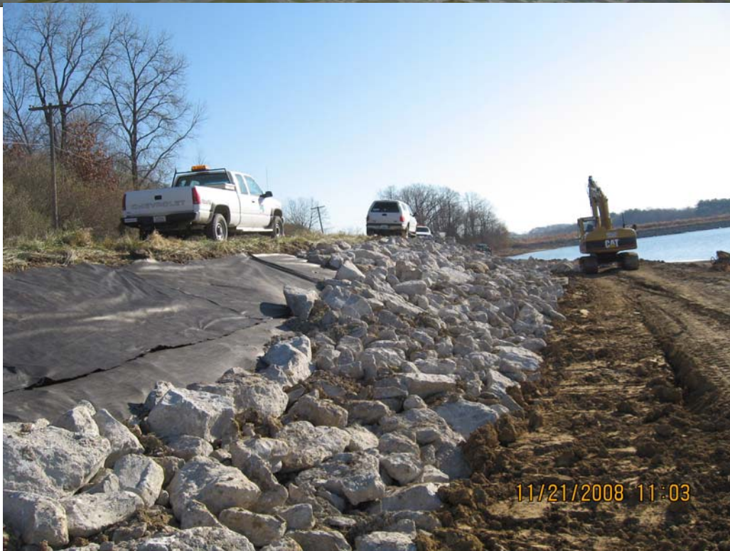
Project Nearing Completion