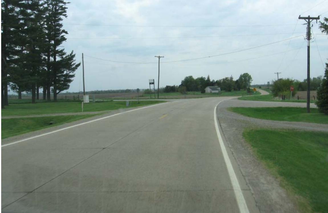
Figure C.5. Side road intersection