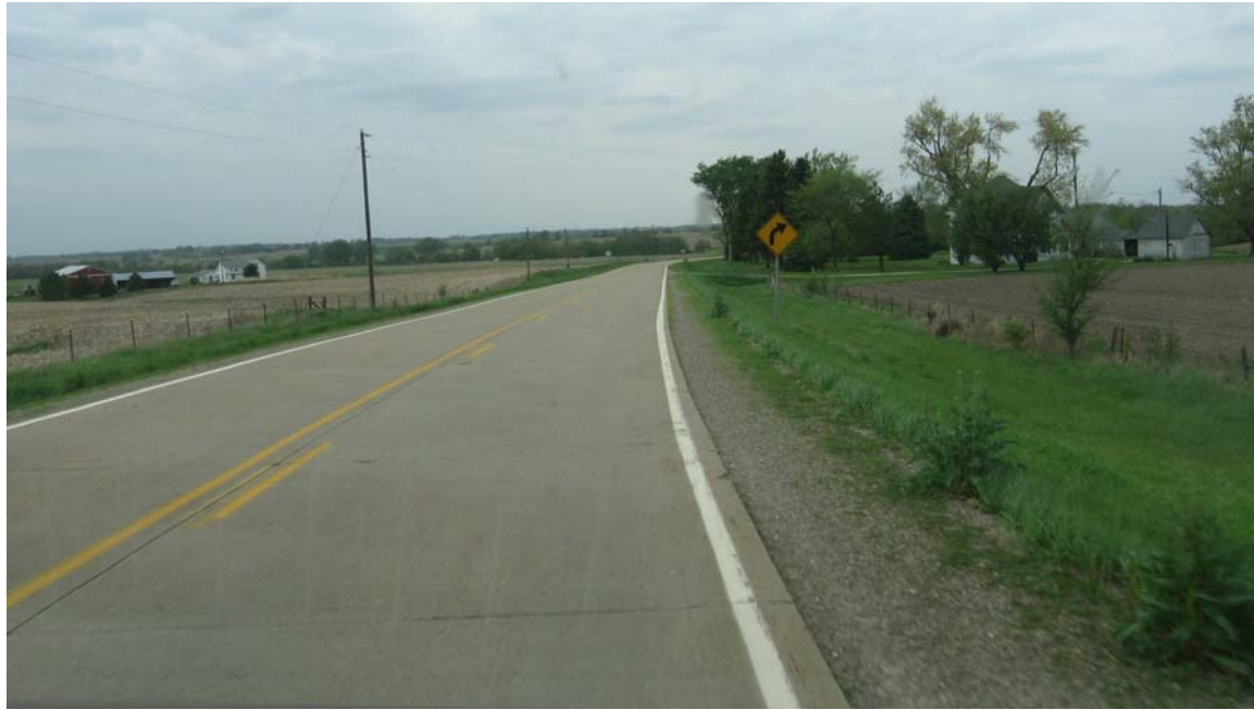
Figure C.4. Existing curve warning sign and pavement markings