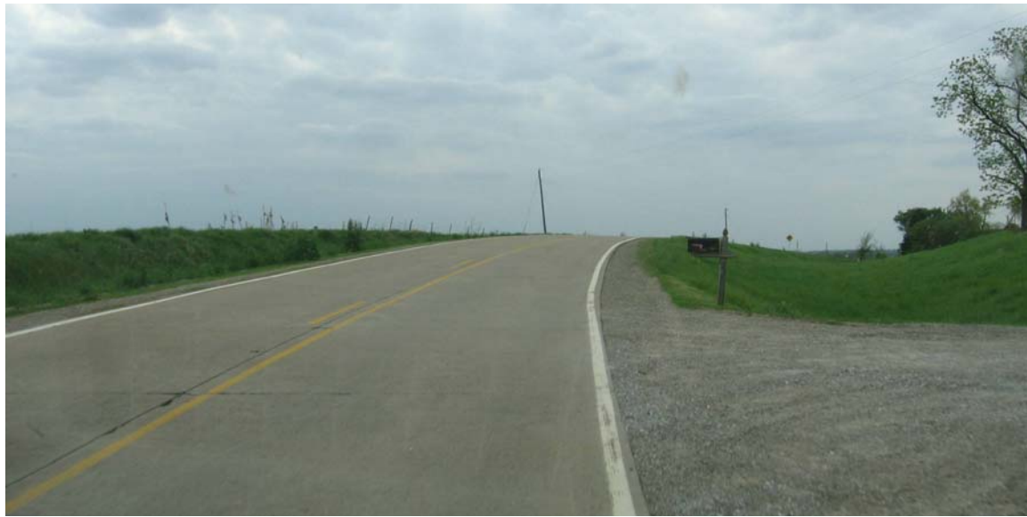
Figure C.3. Combination horizontal and vertical curvature