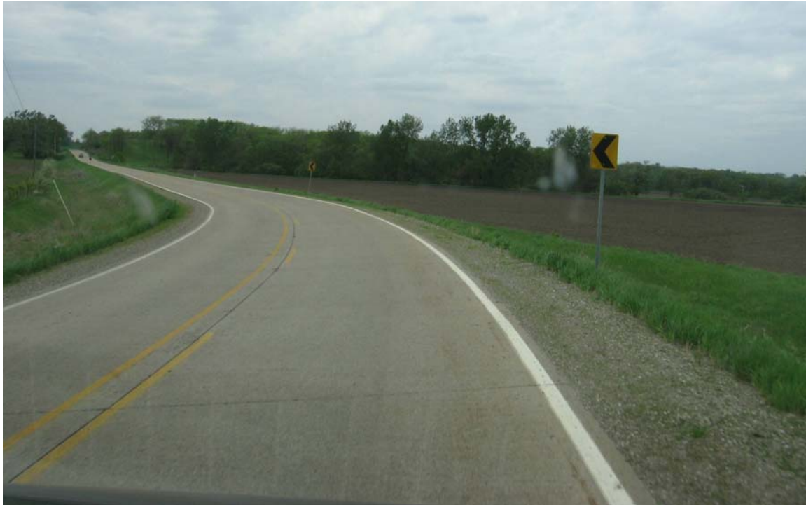
Figure C.2. Existing chevrons in horizontal curve