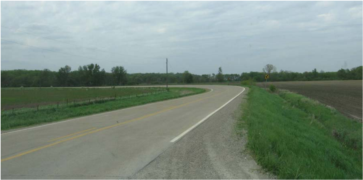
Figure C.1. Horizontal curve just north of 105th Street