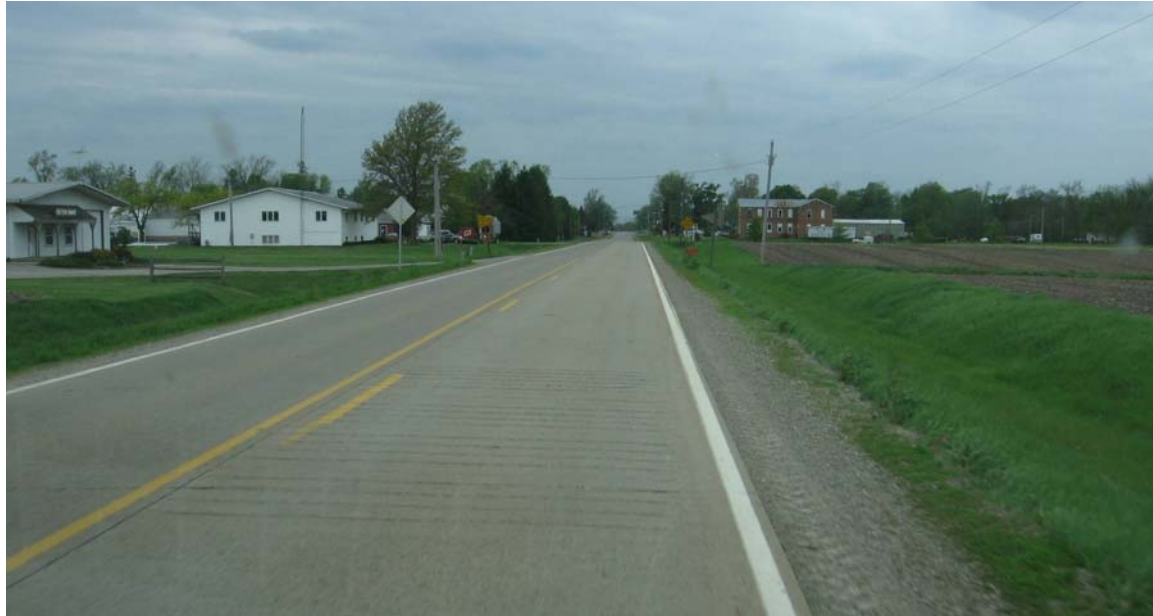
Figure C.6. Entering Columbus City westbound