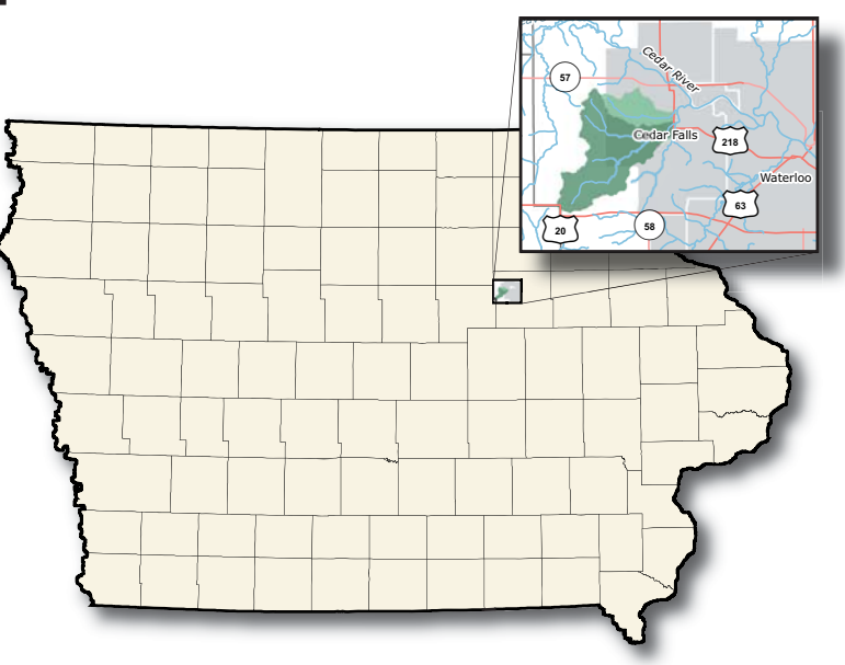
Figure 1 . Location of the two study sub-watersheds in Cedar Falls, Iowa – University Branch (light green) and Southwest Branch (dark green).

An assessment of watershed condition is an important step in helping to determine the best actions to address water quality or quantity issues. While these assessments have traditionally been conducted by driving the watershed and recording observations, new technologies and tools have emerged that enhance the process – particularly within urbanized watersheds. An example of one new tool is the Urban Watershed Management Assistance (UWMA) application developed by the GeoInformatics Training, Research, Education and Extension (GeoTREE) Center at the University of Northern Iowa (UNI). The goal of this student-led project was to develop basic data sets that the City of Cedar Falls and the University of Northern Iowa