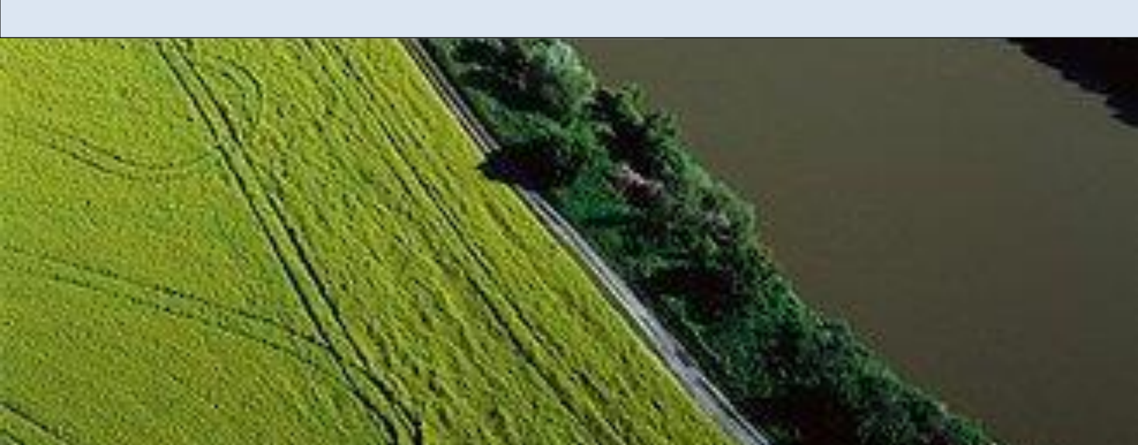
Annual Report to the Iowa Legislature January 2015