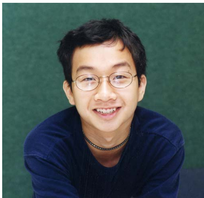
Iowa's Asian Population: 2008

The numeric change in population for native Hawaiian and other Pacific Islanders from 2000 to 2008. This is a 32.9 percent increase for the period.