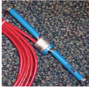
Geokon 4200 vibrating wire strain gage used in this study

In this study, ten joints were made with the early entry sawing method to a depth of 1.5 in., and two strain gages were installed in each of the joints. Another ten joints were made with the conventional sawing method, five of which were sawed to a depth of one-third of the pavement thickness (3.3 in.), and the other five of which were sawed to a depth of one-quarter of the pavement thickness (2.5 in.). One strain gage was installed in each of the joints made with the conventional sawing method. In total, 30 strain gages were installed in 20 joints.