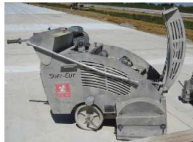
Early entry sawing equipment