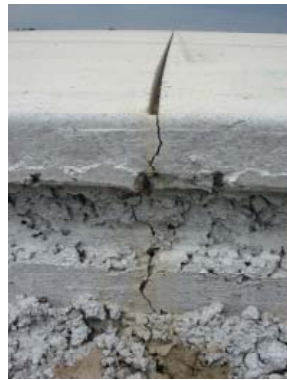
Test section joints showing different sawing depths: conventional sawing to one-third pavement thickness (left), conventional sawing to one-quarter pavement thickness (middle), early entry sawing (right)