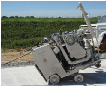
Conventional sawing equipment