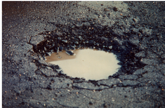
Deteriorated asphalt pavement

Moisture damage is a significant problem for flexible pavements. The damaging effect of moisture on pavements, specifically hot mix asphalt (HMA), is a significant environmental distress that should be considered. As a pavement is subjected to a freeze/thaw cycle, the material expands and contracts. During expansion, water can seep into permeable air voids created with the increased volume and can freeze. When the material contracts during thawing, the water can propagate the cracks created during freezing and cause further damage in the next freeze cycle, ultimately weakening the structural strength of the pavement layer. Over time, the repetition of the freeze/thaw cycle deteriorates the pavement and can lead to mix instability and road damage, such as ruts, if the moisture-susceptible mix is below the surface mix. Surface mixes that are susceptible to moisture damage can experience raveling. Identifying pavements susceptible to moisture damage and the effects of moisture damage on the life of pavement can reduce maintenance costs accrued with the placement of a poorly performing HMA.