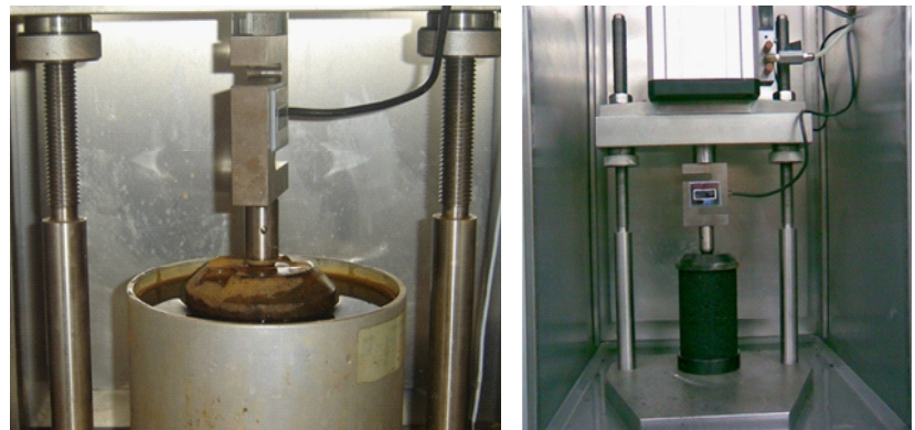
Flow number test setup