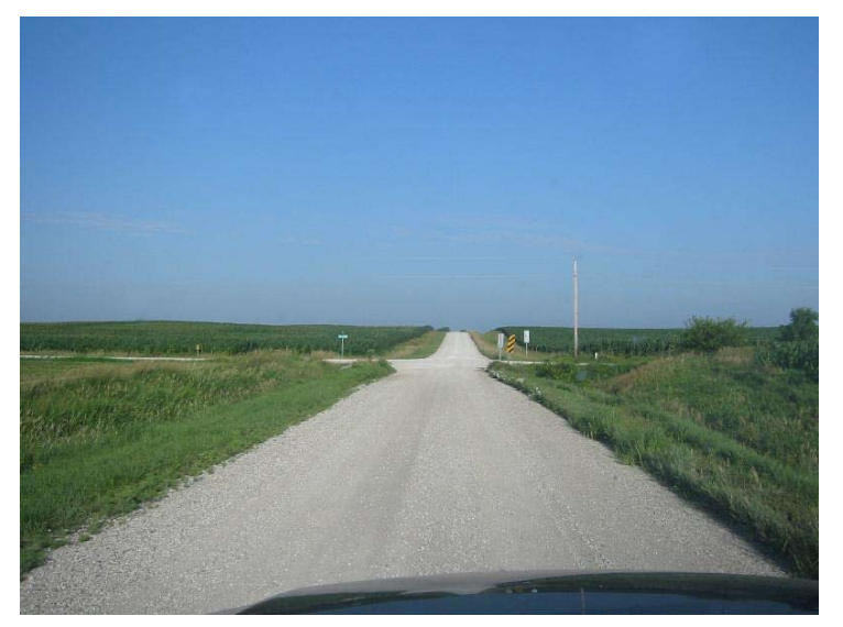
Approaching a very low volume uncontrolled intersection

• Knowledge of the effectiveness of rural stop control will be useful in the development of criteria that can be used to support engineering decisions made by county authorities to reduce or eliminate unnecessary control.