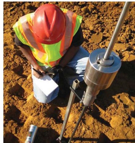
Dynamic cone penetrometer testing