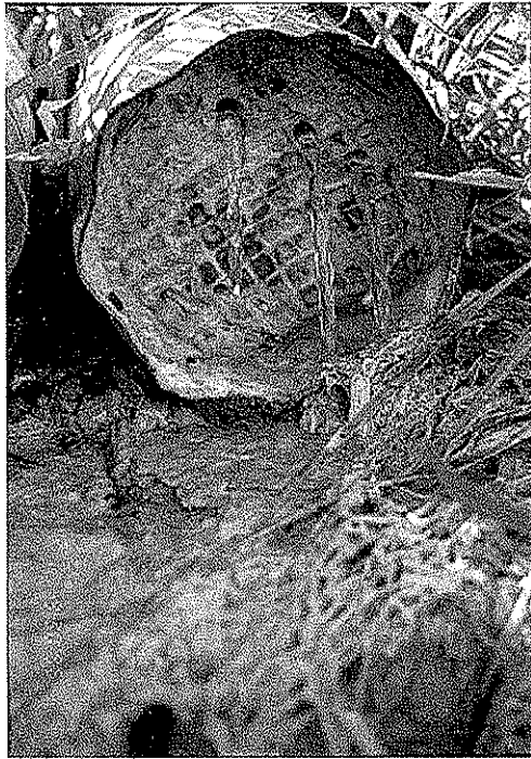
Fig B-2 Plugged drain outlet discharging backed-up water after being punctured with a screwdriver.