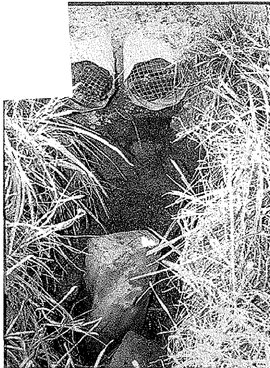
Fig B-4 High pH drainage water impedes vegetation growth and contributes to soil erosion and loss of drain outlet headwalls.