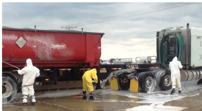
Workers disinfect a truck leaving an infected Iowa poultry farm.

On June 18, Gov. Terry Branstad sent a letter to President Obama requesting a Presidential Disaster Declaration for four counties impacted by avian influenza. Those counties are Buena Vista, Sioux, Webster and Wright. More counties may be added.