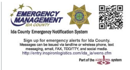
Ida County Alert Iowa business card with QR code.

In Winneshiek County, you may find a billboard telling you how to get emergency messages.