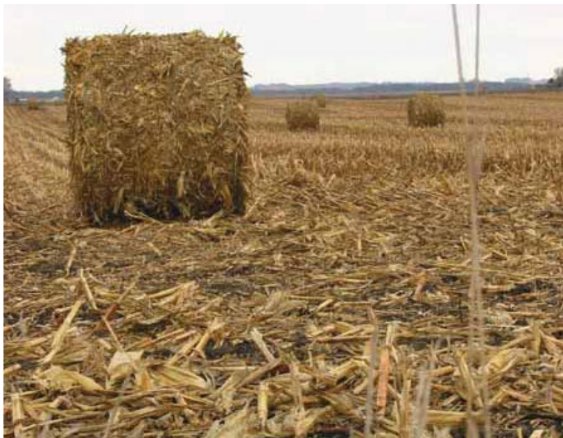
Cornstover used to make bio-oils

Different types of bio-oils derived from three bio-mass sources, oakwood, switchgrass, and cornstover, were examined. All three sources of oils were subjected to physical, chemical, and rheological testing.