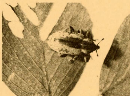
Figure 2. The adult alfalfa weevil is a snout beetle about \frac{1}{4} -inch long.

Adults emerge from the cocoons and feed for a few weeks before leaving the alfalfa to enter summer dormancy in sheltered sites along fence rows, ditches, or vegetation bordering fields. In the fall, adults return to alfalfa fields where they feed, mate, and sometimes lay eggs. Adults overwinter in the soil around alfalfa crowns.