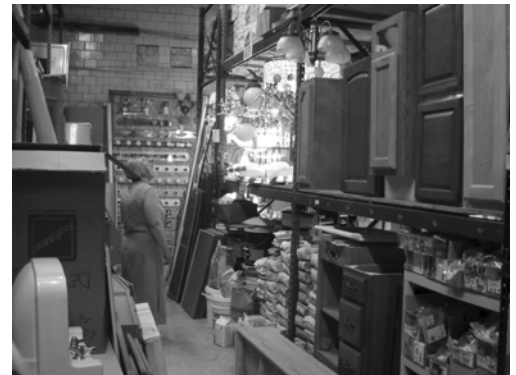
A customer looks at the Des Moines's ReStore inventory