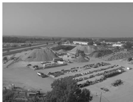
Corell Recycling Division

backfill sub-base for the NW Beaver widening, Des Moines;