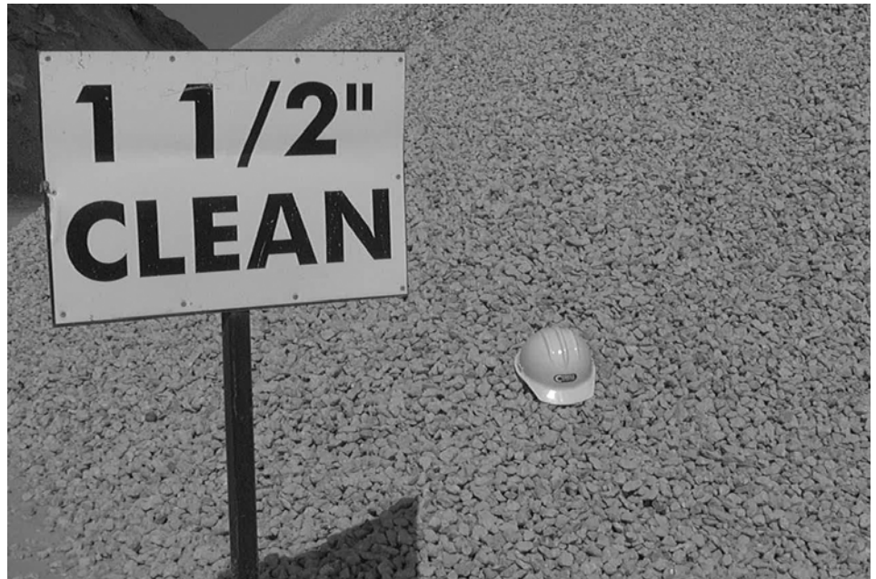
Broken concrete is recycled and reused at Corell Recycling